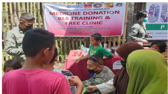
Medical Mission and BLS Training of Rotary Club of General Santos and 94th Marine Battalion Reserve in Camp Abubakar and MILF Communities in Brgy. Tugaig, Barira, Maguindanao