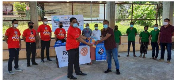
The Rotary Club of Surigao City turned-over 25 pieces of flashlights and 25 units raincoats to the Barangay Tanods and Barangay Officials of Barangay Laurel in the Municipality of Taga-naan, Surigao Del Norte last July 12, 2021. Recognizing the need for these items in their nightly rounds in the barangay, the club responded to this need, at the same time, address one area of focus of Rotary: Peace Building and Conflict resolution.