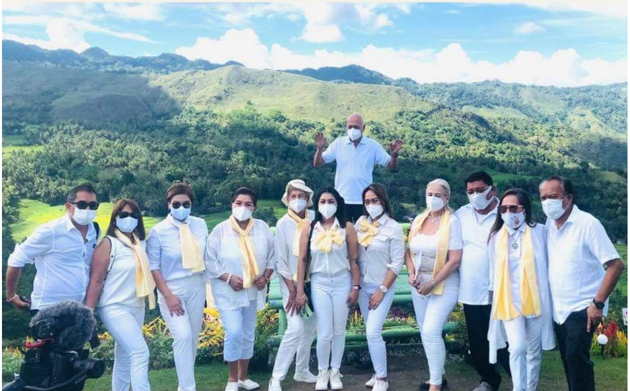
A visit at Land Thai Hills, Barangay Lombog, Guindulman, Bohol