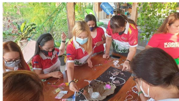
Rotary Club of Polomolok 101 Bead Craft Project with IPs representative .