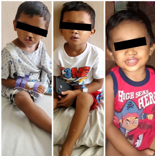
BEFORE and AFTER photos of a four-year-old child who became the recipient of Rotary Club of Ormoc Bay's signature project iMakeYouSMILE, which provides free surgery for children with cleft lip and/or palate. The photos were taken before, 2 days after, and 6 days after surgery.