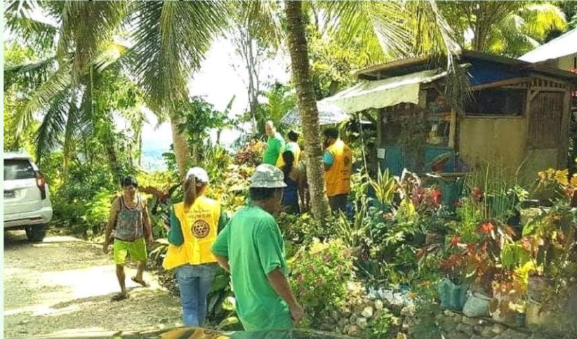
A flower store along the way to Laca, Jagna, Bohol, Philippines

To the delight of the vendors and owners. The club promoted these stores thru Facebook and other social-media platforms hoping that other plant enthusiasts will come and buy plants from their stores.