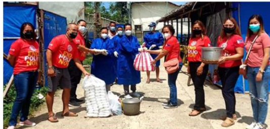
Rotary Club of Calbayog shares food packs and arrozcaido to 62 quarantined covid-19 positive patients, 3 medical frontliners and 14 covid warriors in Braville LIGTAS COVID CENTER at Brgy. Anislag, Calbayog City, Samar last July 30, 2021.