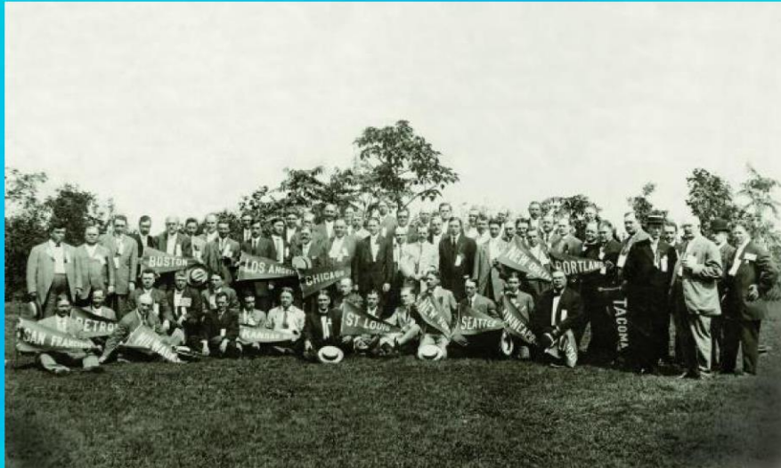
Attendees at Rotary's first convention in Chicago in 1910. Rotary's first fiscal year began the day after the convention ended.

Ever wonder why 1 July is the beginning of the Rotary year? Initially, our conventions played a key role in determining the start date of our fiscal and administrative year.